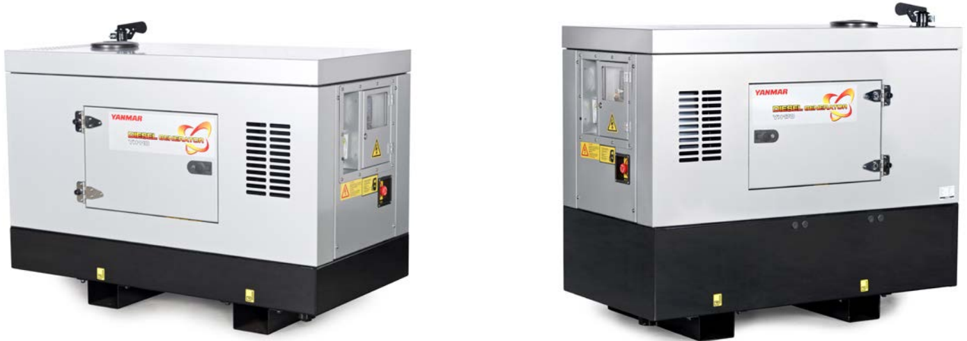
Optional large capacity fuel tank available (LT)

4 Pole, Single Phase, Silent type Generator output 6.6 – 29.2kVa