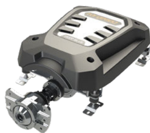
Deep Blue 100 i