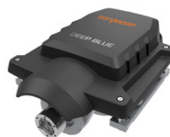
Deep Blue 25/50 i

This 100 kW motor was specifically constructed to power fast, planing motorboats. With a reliable, low-maintenance, direct-drive design, the Deep Blue 100i delivers extraordinary performance, with up to 2,700 RPM and a torque of 437 Nm.