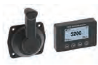
Evo Side Mount Control