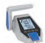
Evo Top Mount Control

You could always find a control that best fits your boat.