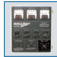
Length - 14" x Height - 17" x Depth - 6.25"

Includes: Engine temperature gauge, DC volt meter, AC voltmeter, AC frequency meter, AC ammeter with harness, oil pressure gauge, start/stop, and shutdown bypass/preheat switch. Available as flush mount or with enclosure (L: 14" x H: 17" x D: 6.25")