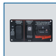
Length - 5.5" x Height - 2.88"

S-1 Panel. Includes: run light, start/stop and shutdown bypass, preheat switch (L: 3.38" x H: 2.88")