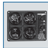
Length - 7" x Height - 5.25"

S-3B Panel. Includes: DC voltmeter, water temperature gauge, oil pressure gauge, engine hourmeter, start/stop, and shutdown bypass/preheat switch. Includes a NMEA compliant enclosure (L: 10" x H: 8" x D: 4")